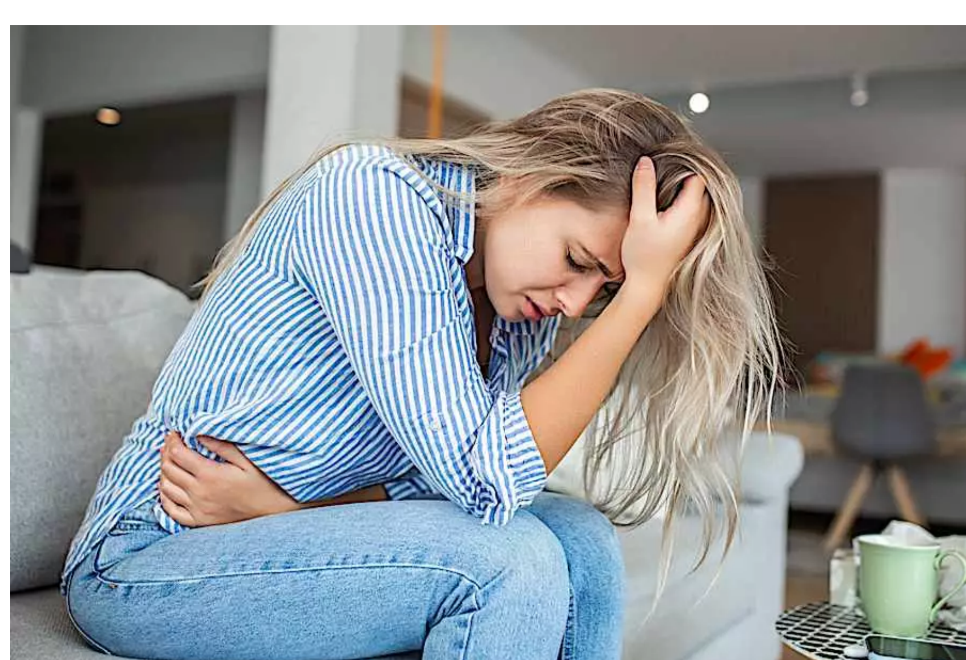
When IBS controls your life: Can this simple tip help?

The King has bestowed the highest award for voluntary service on an "outstanding" community cafe, food bank and 'free' shop.